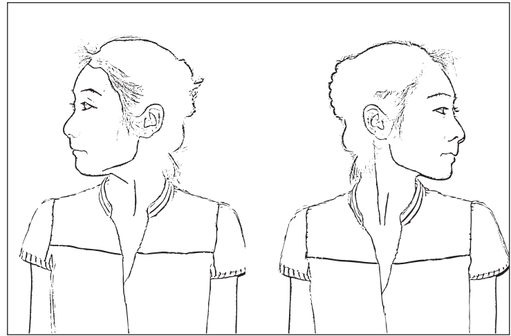
Figure 2: Rotation Exercise