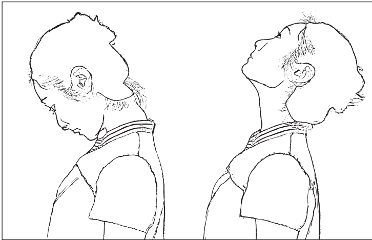
Figure 1: Flexion & Extension Exercise